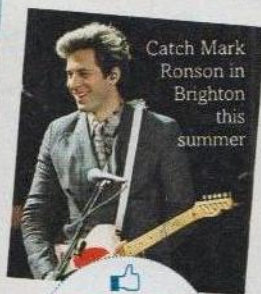
Catch Mark Ronson in Brighton this summer

Win five pairs of tickets to Shakedown festival on FB!