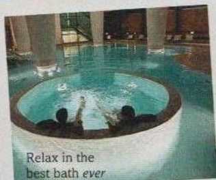
Relax in the best bath ever

Why not stay over? Book into Queensberry Hotel ( Thequeensberry.co.uk ), from £130 per room, per night.