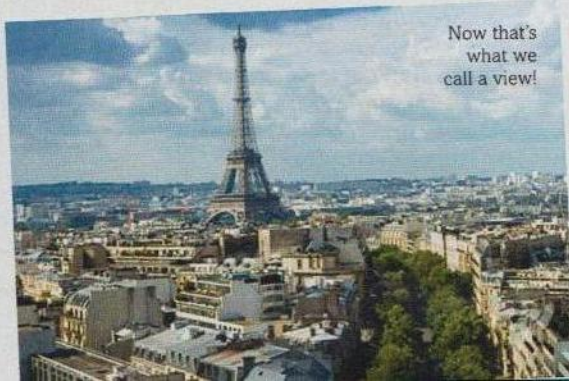
Now that's what we call a view!

Why not stay over? We like Clarion Collection Opera Pavillon Hotel ( Hotels.com ), from £83 per room, per night.