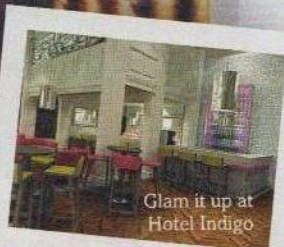
Glam it up at Hotel Indigo

Why not stay over? Head to Hotel Indigo ( Hotelindigo.glasgow.com ), from £130 per room, per night.